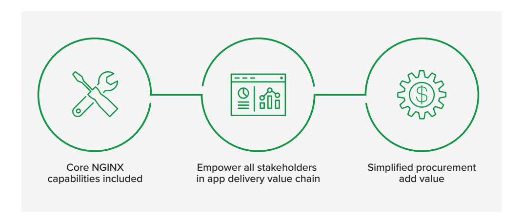
Figure 1: The best of all worlds

NGINX is a proven technology for optimizing application and API performance, security, and scalability in varied cloud environments. Its lightweight design, extraordinary versatility, and consistent stability have made it a go-to tool, particularly for developers needing to optimize delivery and security near their code. NGINX is used by a third of all websites, has over a billion docker image downloads, and is used in nearly half of the organizations running containers.